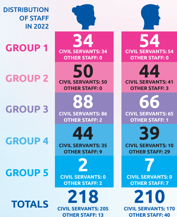
DISTRIBUTION OF STAFF IN 2022