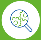
Research and Development